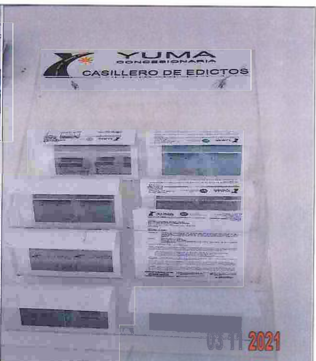
EDICTOS DE LA R_31413 YC-CRT-107742